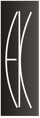
Art. Tote bag, shopper