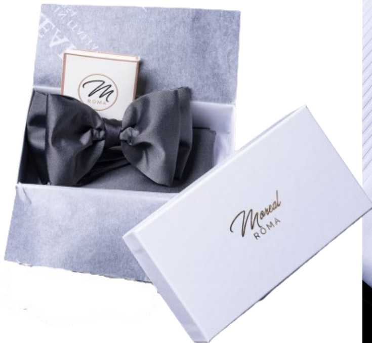
Bow tie 100% Silk, Cotton and Polyester with pocket handkerchief. Assortments in different colors and patterns.