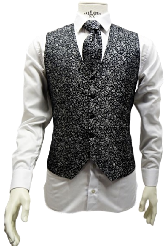
waistcoat and tie set 100% Viscose Jacquard. Assortments in different colors and patterns.