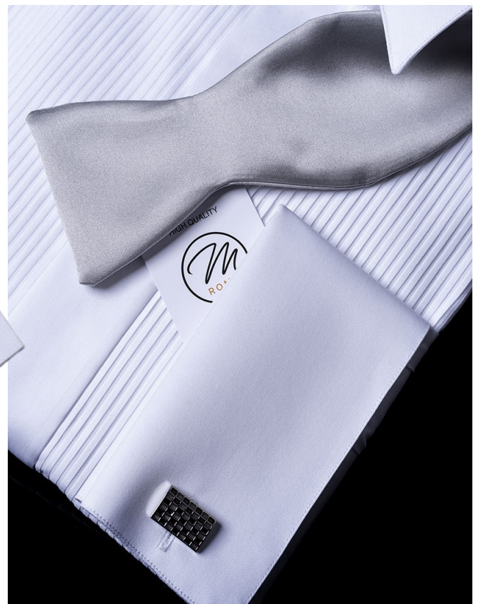
Bow tie 100% Silk, Cotton and Polyester. Available in different colors and patterns.