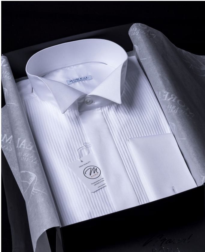
Pleated tuxedo shirt, covered buttons and cufflinks. 100% double twisted cotton.