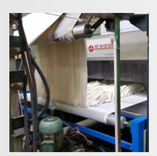
RF drying of slivers 2 Ton/day throughput