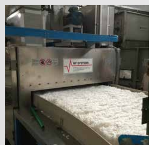
RF drying of loose stock 600 Kg/h throughput