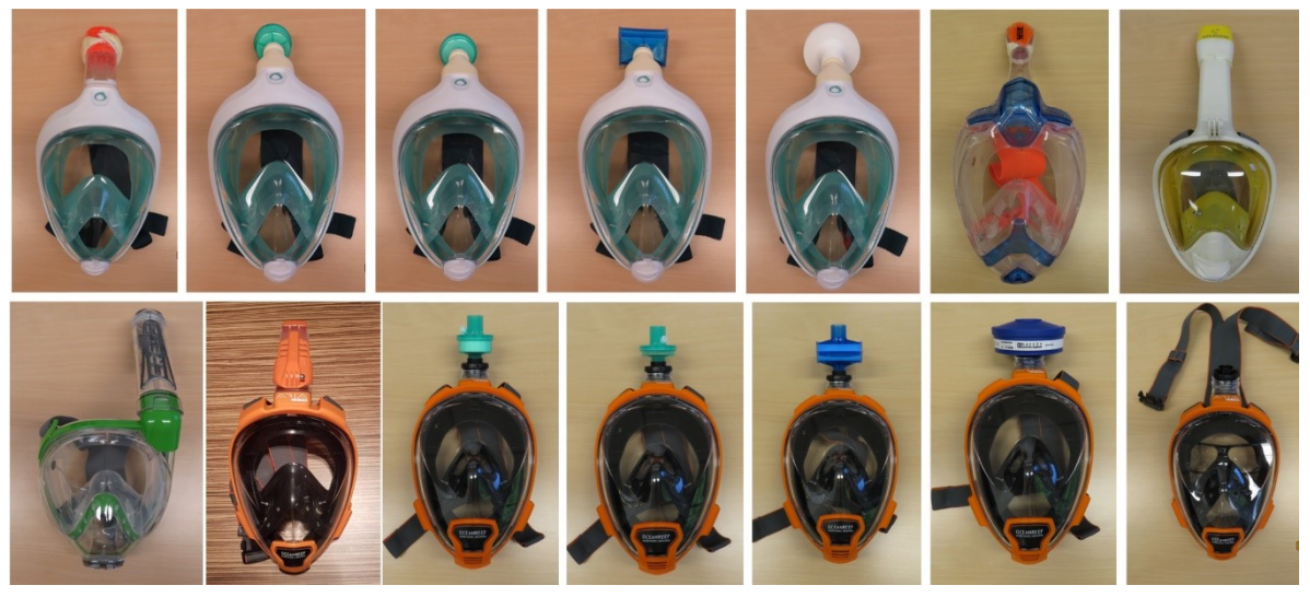
Figure 1. Snorkel mask configurations tested