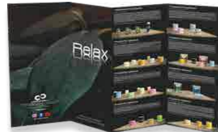
100A1500000000 Relax Folder 270 x 110mm