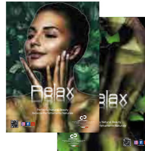
100A0400000000 Relax line poster 1000 x 700mm