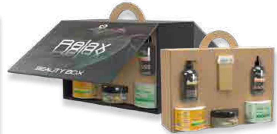
110A1800000000 Relax Beauty Box For 12 products 410 x 300 x 250mm