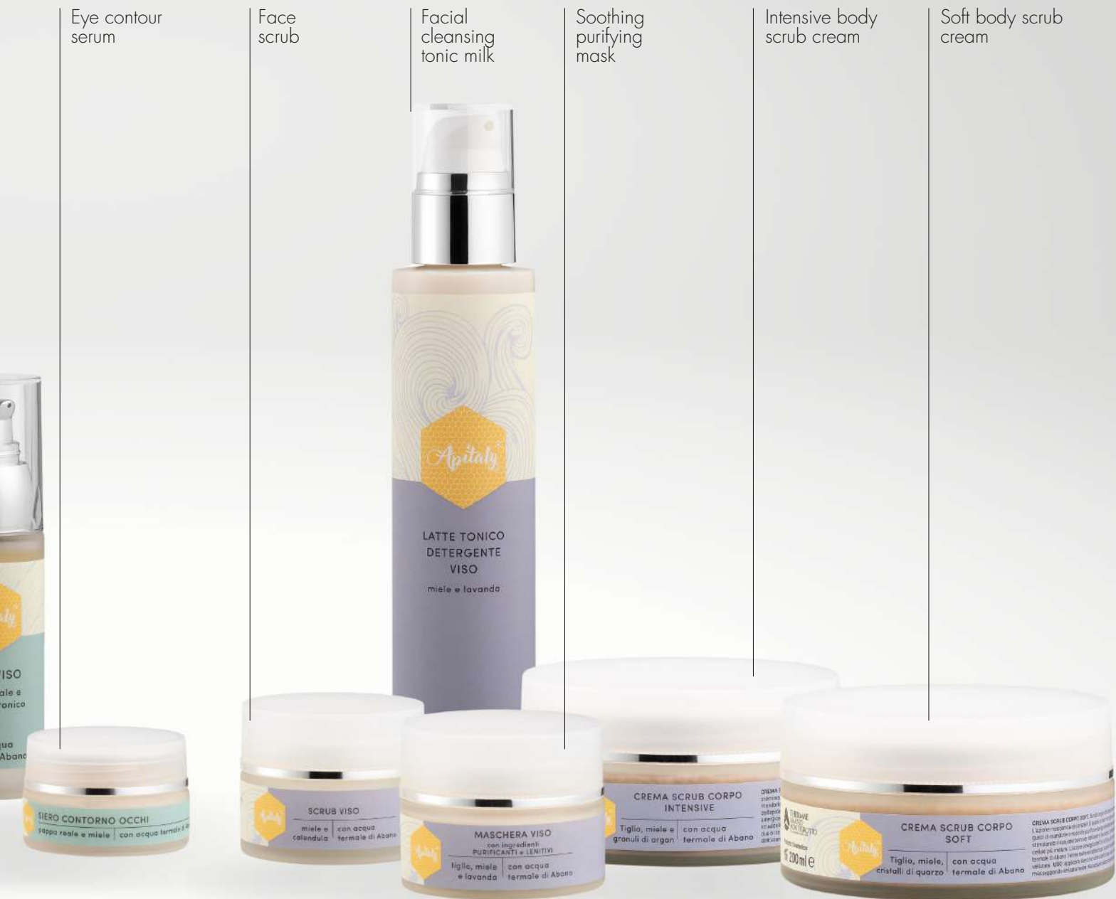
Eye contour serum