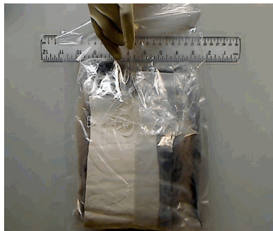
View of content