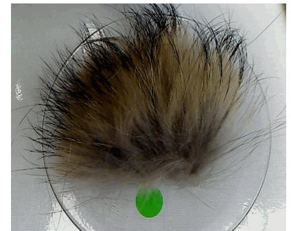
4111.0mg analyzed (1mm x 1mm scale)

Disclosures: All work was done at Beta Analytic in its own chemistry lab and AMSs. No subcontractors were used. Beta's chemistry laboratory and AMS do not react or measure artificial C 14 used in biomedical and environmental AMS studies. Beta is a C14 tracer-free facility. Validating quality assurance is verified with a Quality Assurance report posted separately to the web library containing the PDF downloadable copy of this report.