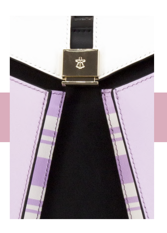
LIZ FLAP MINI STRIPES