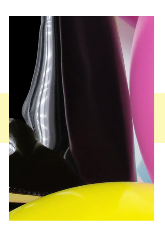
LIZ FLAP PVC