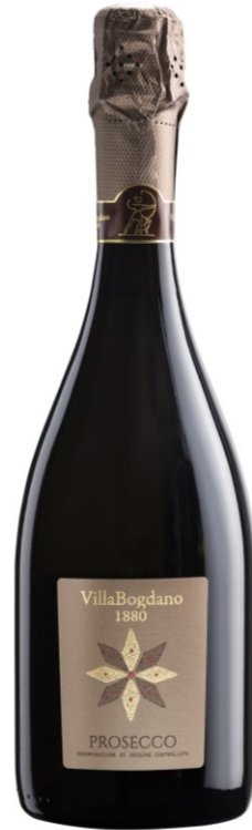
Brut Millesimato DOC Prosecco