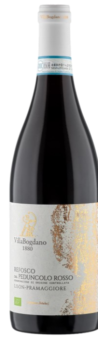
Refosco D.P.R. DOC Lison Pramaggiore