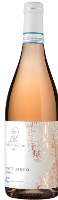
Pinot Grigio Ramato DOC Venezia