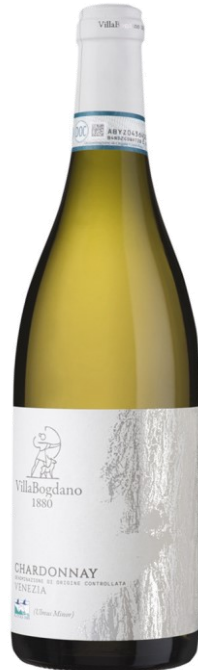
Chardonnay DOC Venezia