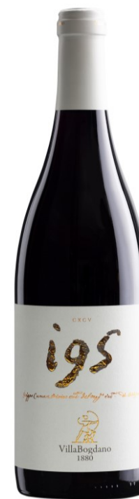
From a selection of Merlot and Cabernet Sauvignon grapes Rosso IGT Veneto 2017 3076 bottles