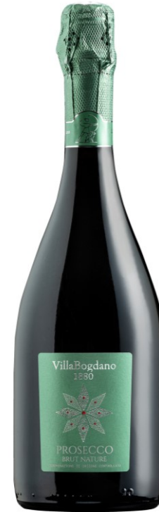
Brut Nature Millesimato DOC Prosecco

Label: homage to the mosaic representing a wind rose on the floor of the wine shop, original from the 16th century and recently restored by a Venetian craftsman