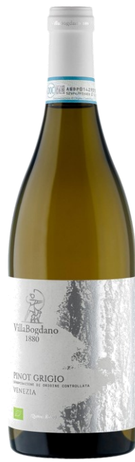
Pinot Grigio DOC Venezia