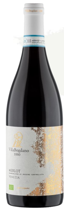
Merlot DOC Venezia

Label: homage to the essences of the lowland forest dating back to medieval times and Natura 2000 site; each reference depicts a different essence bark to which it has been associated