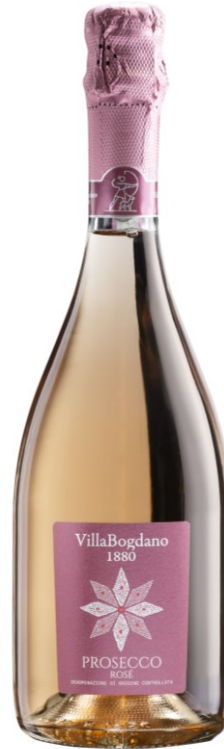
Rosè Brut Millesimato DOC Prosecco