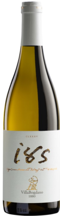
From a selection of Tocai Friulano grapes Bianco IGT Veneto 2018 3072 bottles