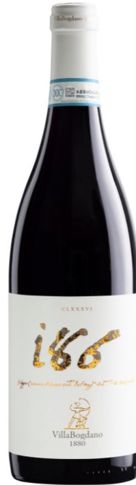
Refosco D.P.R. Lison Pramaggiore DOC Riserva 2017 3300 bottles