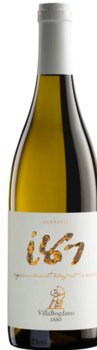
Chardonnay IGT Veneto 2018 1376 bottles