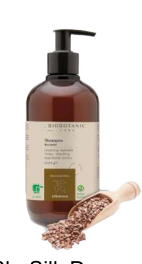
Sh. Silk Down