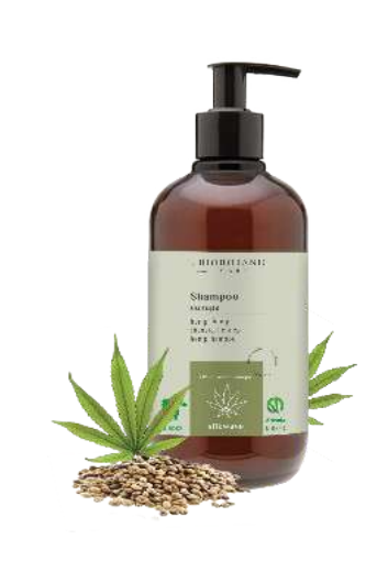
Sh. Silk Wave