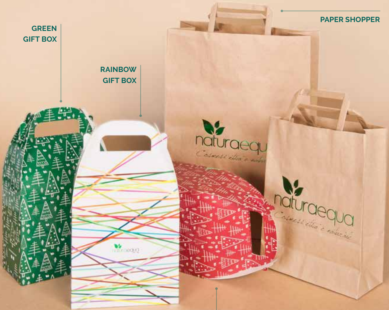
RED GIFT BOX