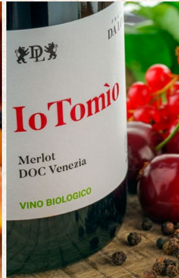
IoTomìo Merlot DOC Venezia