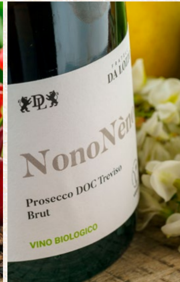
NonoNèno Prosecco DOC Treviso Brut