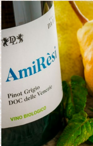
AmiRèsi Pinot Grigio DOC delle Venezie