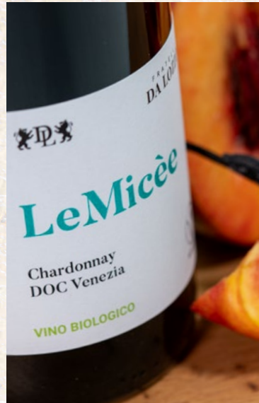
LeMicèe Chardonnay DOC Venezia