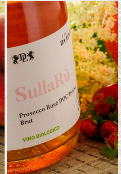
SullaRù Prosecco Rosé DOC Treviso Brut