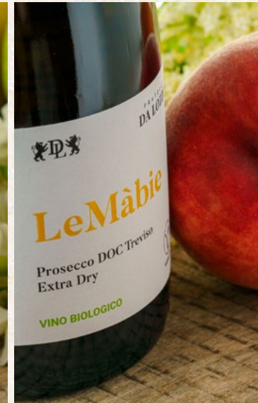
LeMàbie Prosecco DOC Treviso Extra Dry