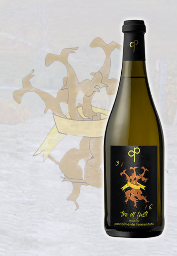
Sweet sparkling wine