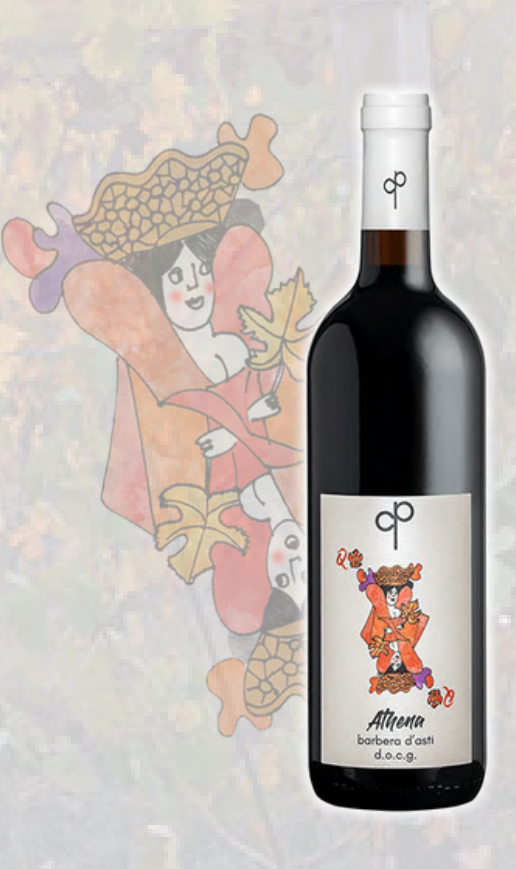
Barbera d'Asti d.o.c.g.