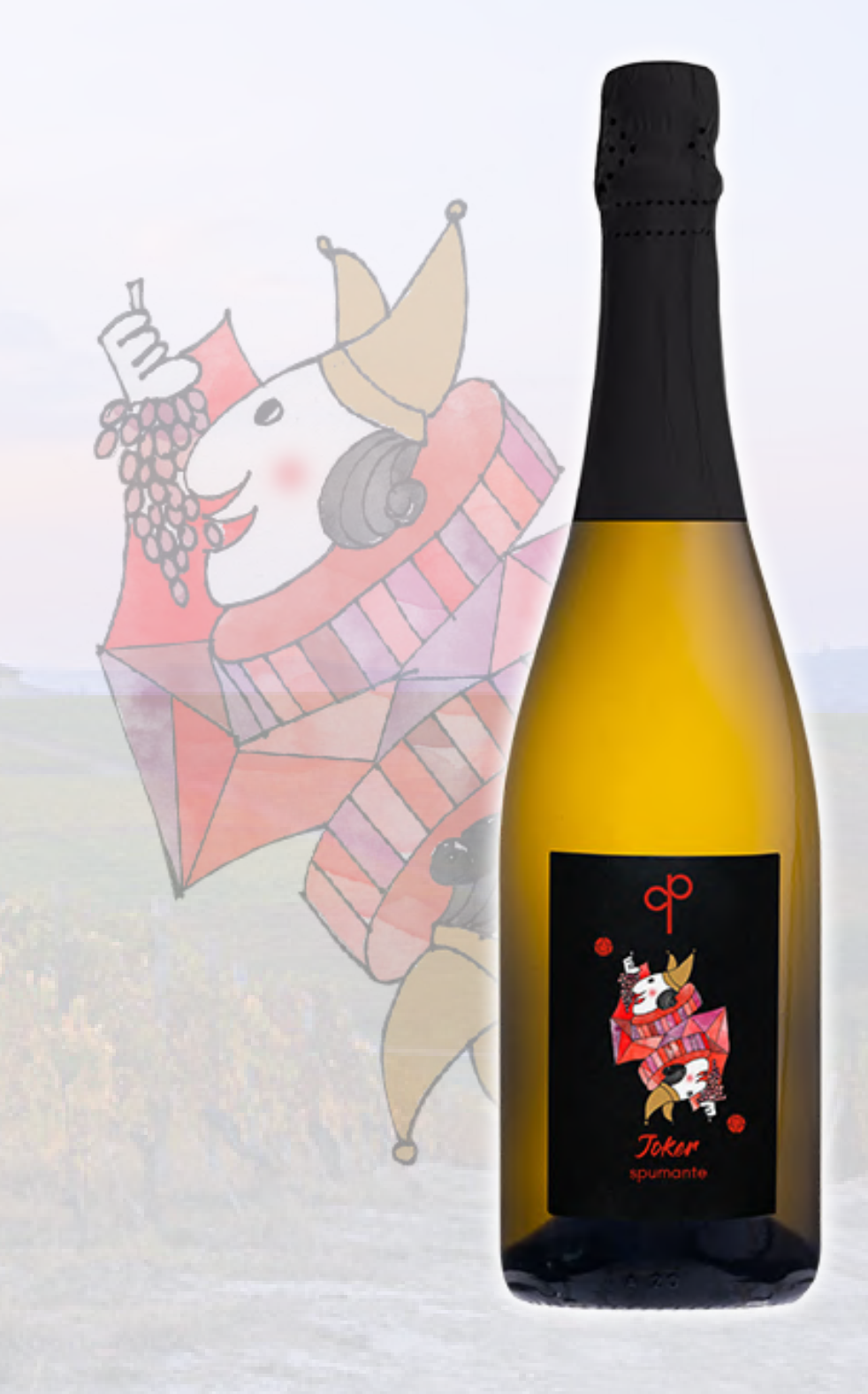
Rosè Sparkling wine