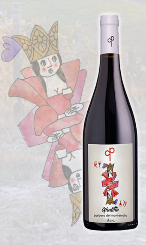
Barbera del Monferrato d.o.c.