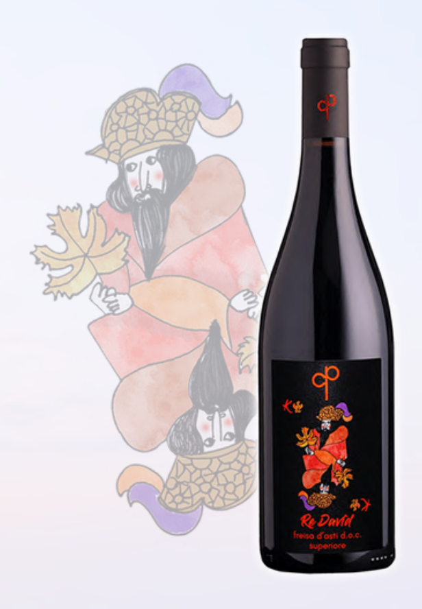
Freisa d'Asti Superior d.o.c.