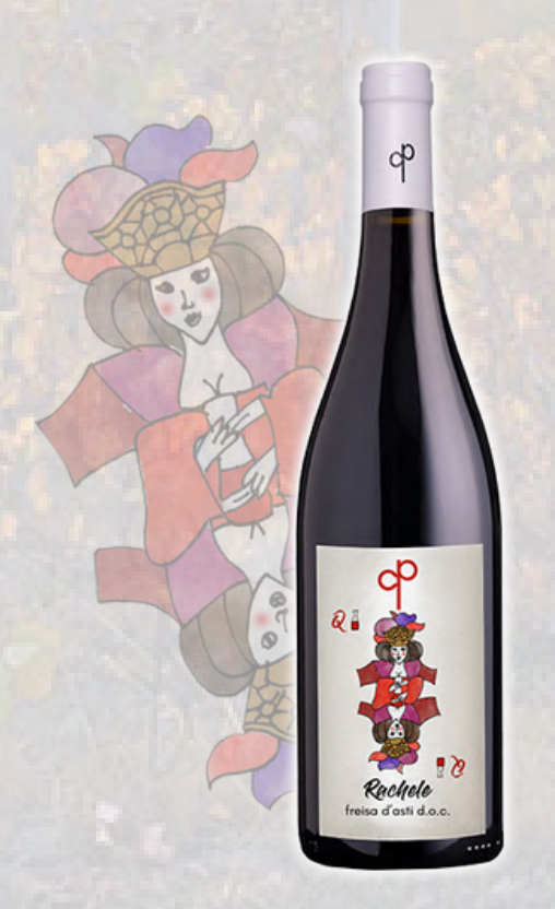
Freisa d'Asti d.o.c.