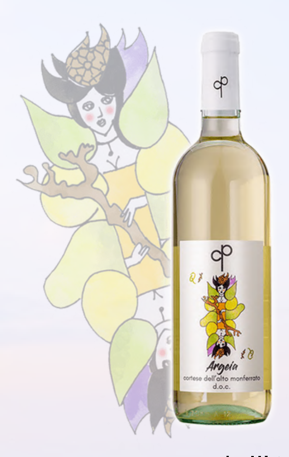
Cortese dell'Alto Monferrato d.o.c.