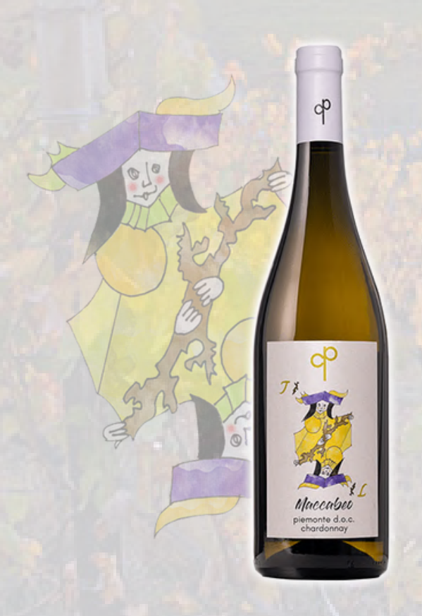
Piemonte Chardonnay d.o.c.