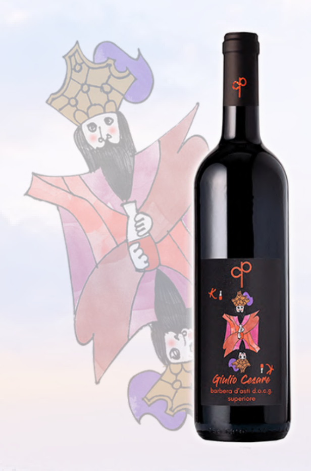
Barbera d'Asti Superior d.o.c.g.