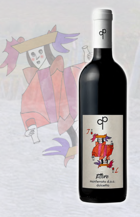
Dolcetto Monferrato d.o.c.