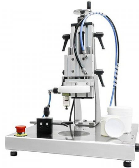
Tabletop Capping Machine