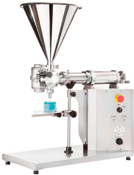
Tabletop Filling Machine