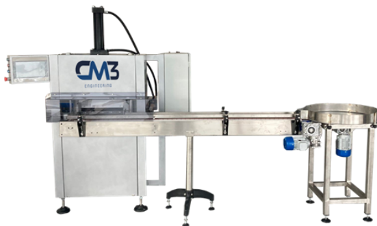
Bath bombe press