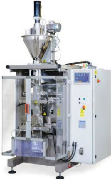
Single-dose Packing Machine