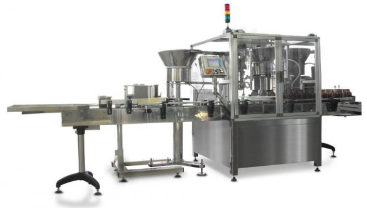
Filling and Capping Monoblock