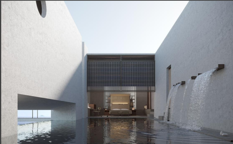
Project : The White Cliff, March 2019

Despite how far an ocean liner can voyage, it too will come to a halt somewhere even the waters there is claimed by no one nor under any jurisdiction. Again, predestined, we return. Imaginably, there is also a plane we can take from here to there, faster and can go much much further. Even the whole plane is loaded with the most inconceivable fuel, equipped with a space energy of some sort, somehow it has to land at the furthest runway, even though what is presented at the arrival only reveals how insignificant a distance we have covered, regardless of the resources and ambition we have gathered at the origin of departure