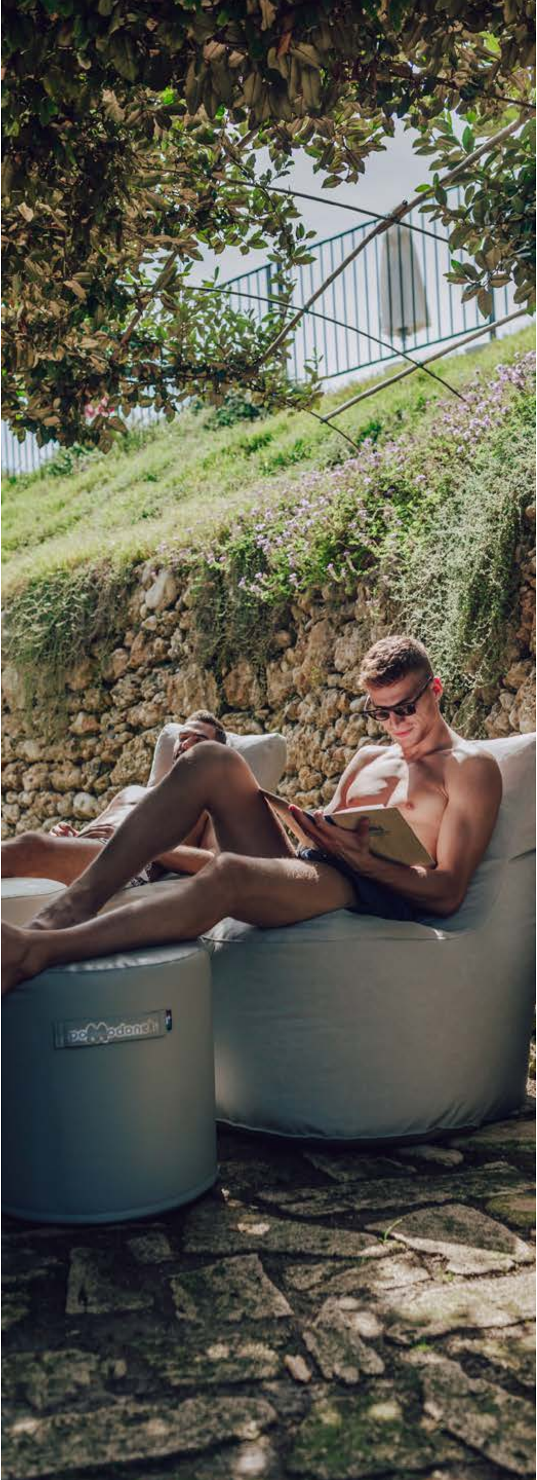
Cylinder and Cube Whether they are used as a seat or as a table, these complements allow to play with the environment thanks to their lines and shapes.

PADDED CANVAS FOR DECK CHAIRS WIDTH 126X43 CM THICKNESS 2 CM WEIGHT 2,00 KG