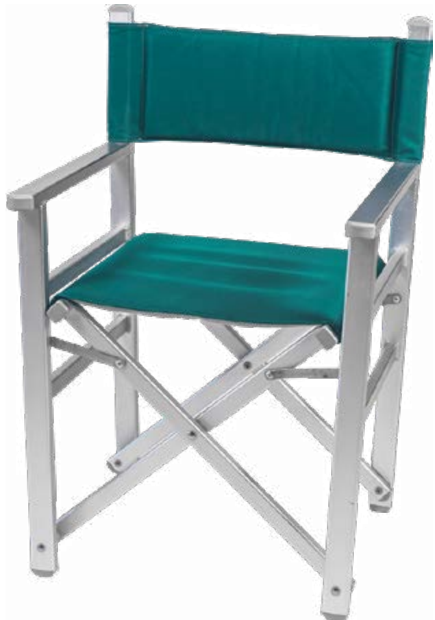
Padded canvas for director chair and deck chair These padded canvases have been designed to serve the needs of those who want to improve their beach furniture making them comfortable and welcoming for their guests.

PADDED CANVAS FOR DIRECTOR CHAIR SEAT 42X52 CM BACKREST 20X57 CM THICKNESS: 2 CM WEIGHT 2,00 KG