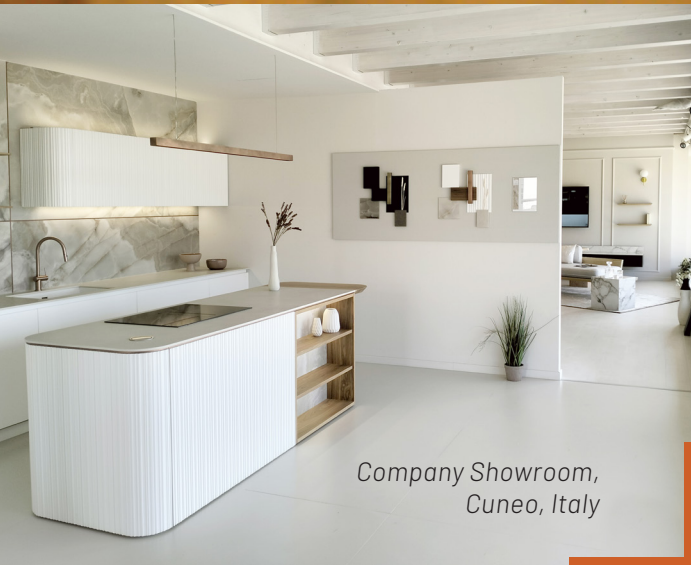
Company Showroom, Cuneo, Italy

La Bottega del Falegname constantly searches for the ideal architectural firms, interior design studios, general contractors, and selected retailers to accompany it on its journey: business partners that can fully enhance that special uniqueness and added value of the Bottega's work.