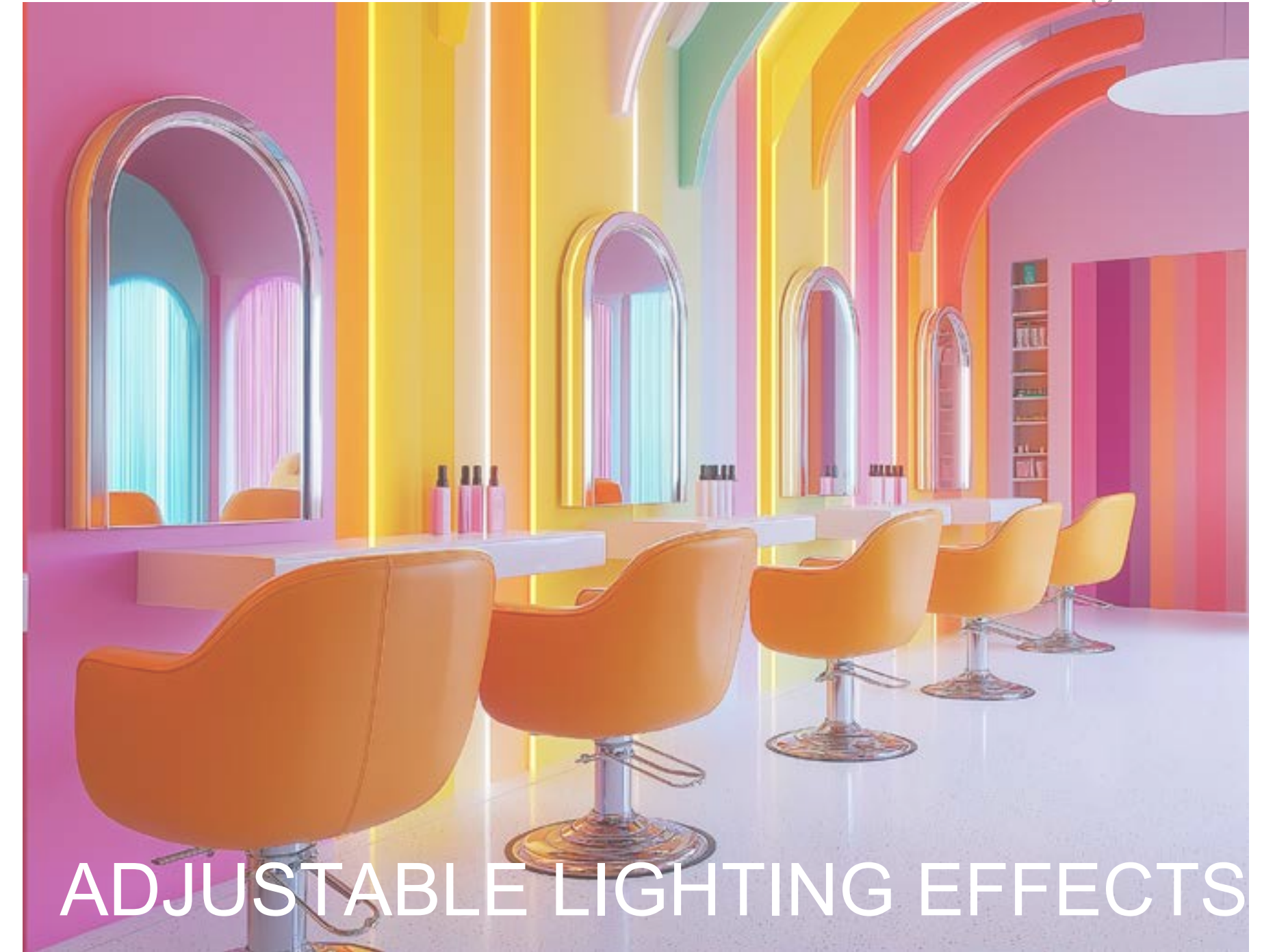
ADJUSTABLE LIGHTING EFFECTS