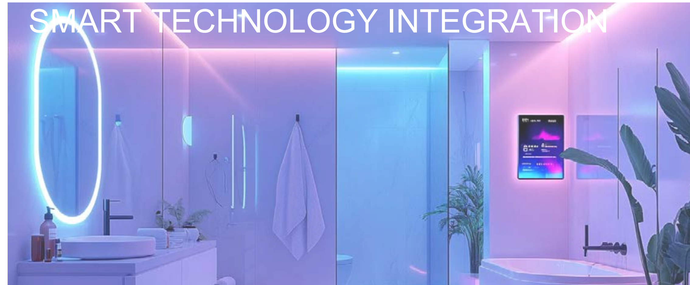
SMART TECHNOLOGY INTEGRATION