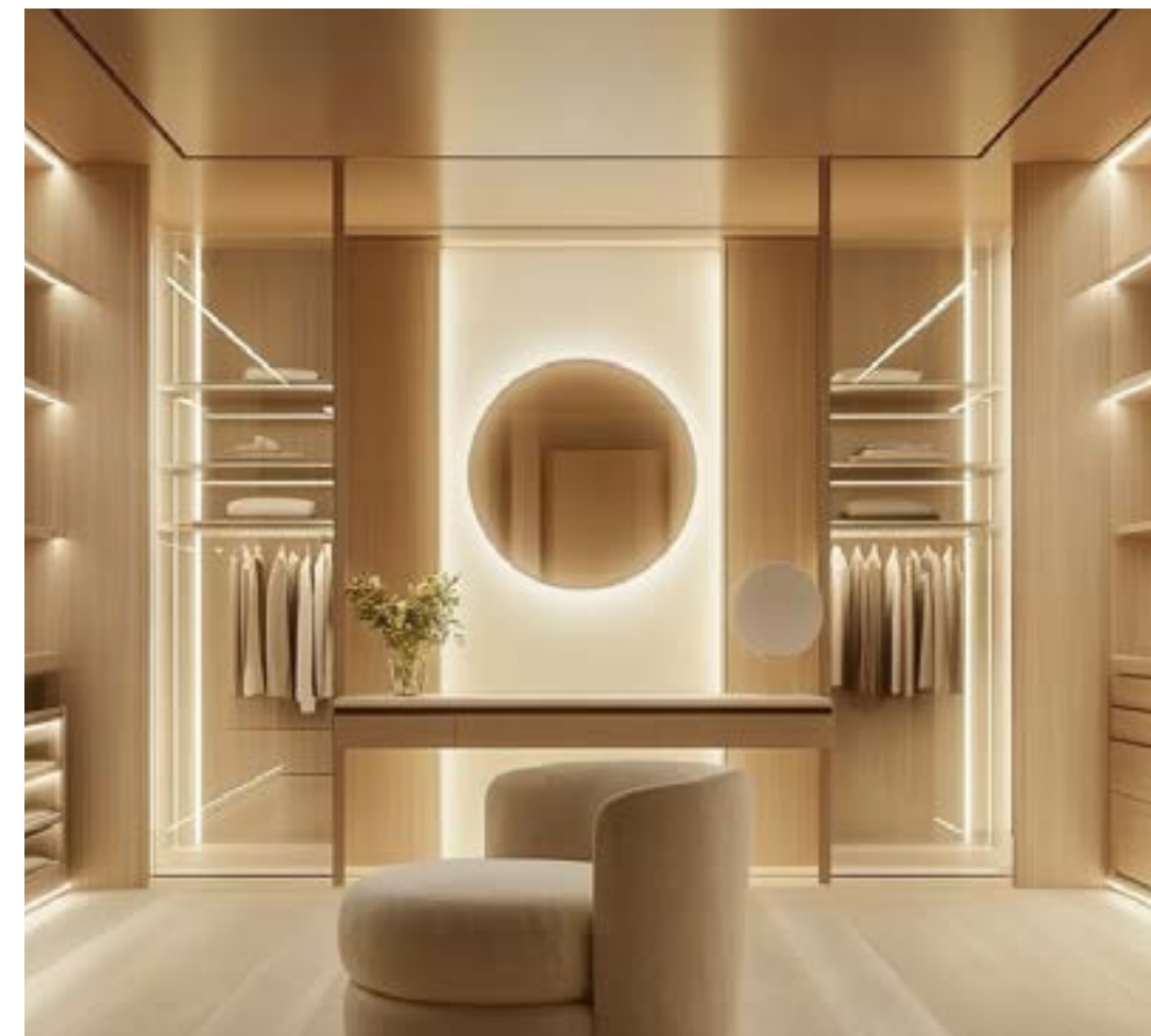
DESIGN ELEGANTE E MODERNO