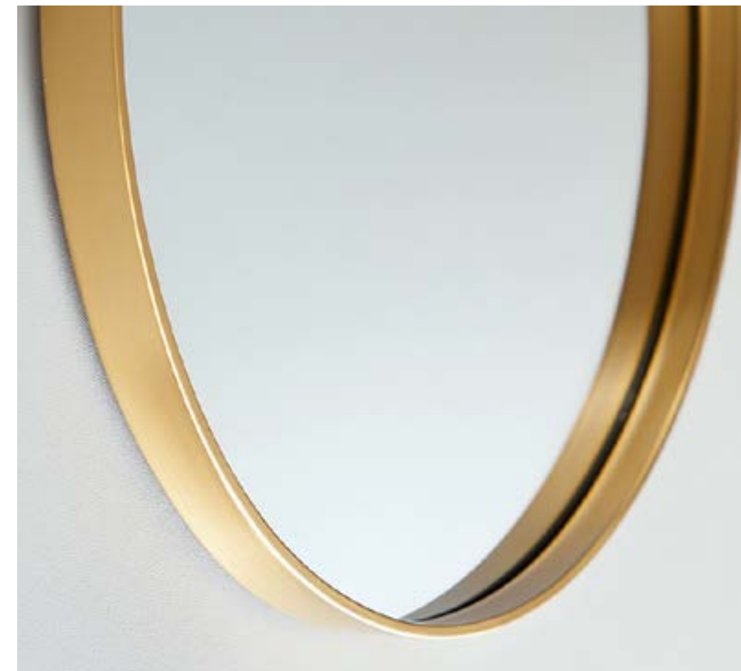
TOP-NOTCH RAW MATERIALS