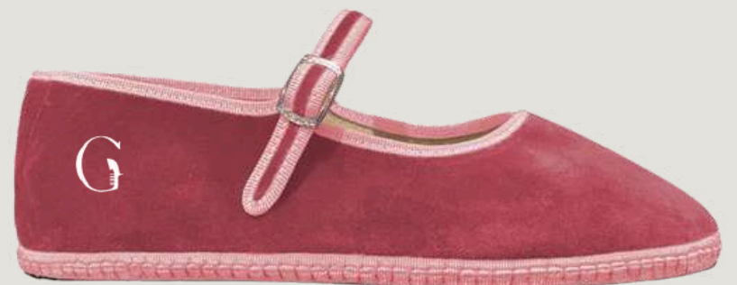
Light Pink Retail Price 189 $ Whole sale Price: 85$