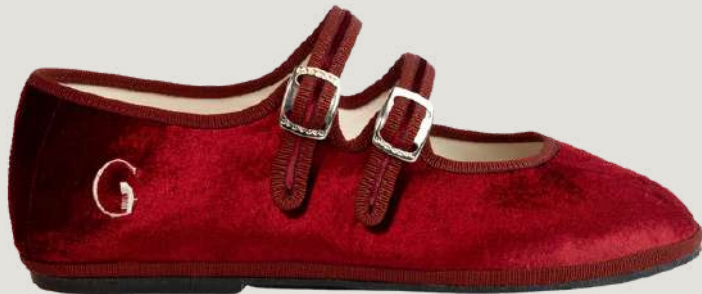
Accademia Silk Red Retail Price 249 $ Whole sale Price: 119$