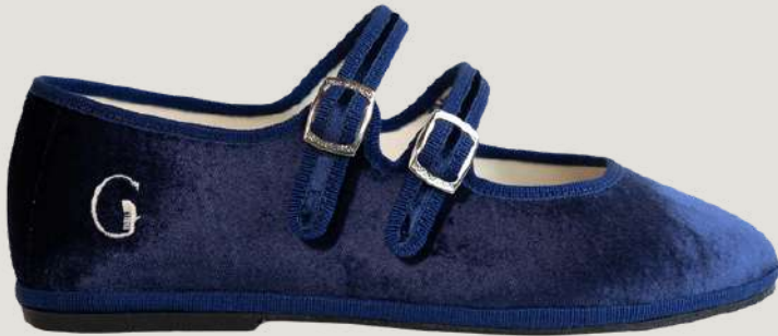
Guglie Silk Blue Retail Price 249 $ Whole sale Price: 119$