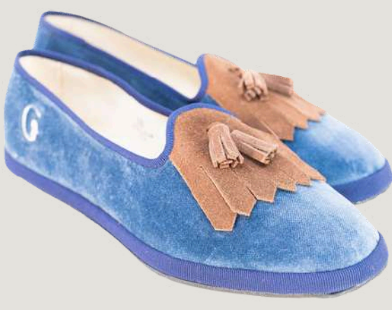
Dolomitica Ocean Blue