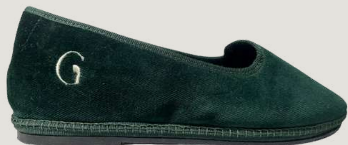
Bush Dark Green Retail Price 199 $ Whole sale Price: 92$