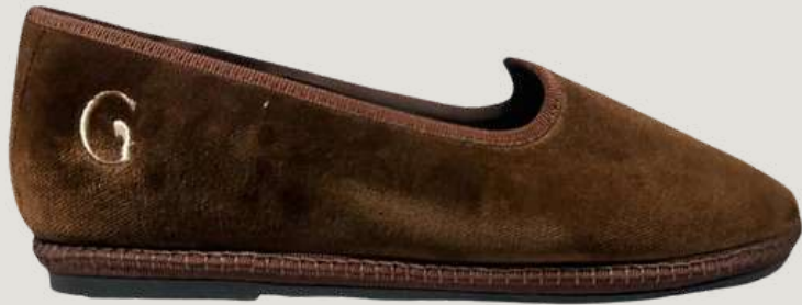
Tobacco Brown Retail Price 199 $ Whole sale Price: 92$

Our classic handmade in Italy model, with an extra comfortable ergonomic patented sole