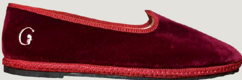
Burdeaux Retail Price 199 $ Whole sale Price: 92$