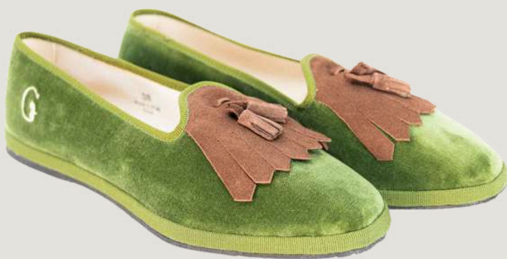
Dolomitica Forest Green