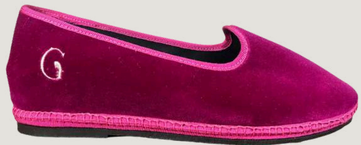
Pink Fuxia Retail Price 199 $ Whole sale Price: 92$