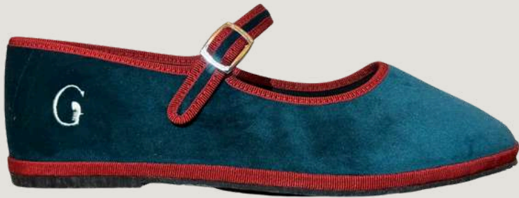
Ocean Fire Retail Price 189 $ Whole sale Price: 85$

Handcrafted in Italy, the Mary Jane by Gondolina blends classic charm with modern comfort. With a refined strap, subtle elevation, and Venetian-inspired design, it's perfect for any occasion.