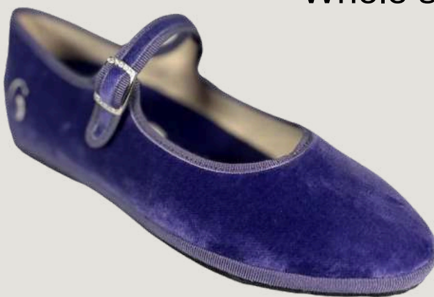
Lile Purple Retail Price 229 $ Whole sale Price: 95$

Sizes EU: 20,21,22,23,24,25,26,27,28,29,30,31,32,33,34,35,36,37,38,39,40,41,42,43,44,45,46,47