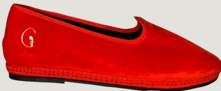
Shiny Orange Retail Price 199 $ Whole sale Price: 92$