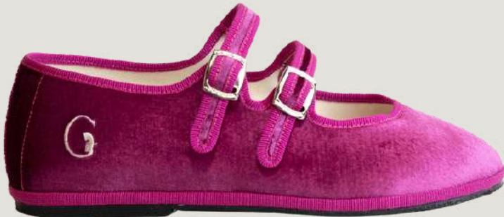
Scalzi Silk Pink Retail Price 249 $ Whole sale Price: 119$