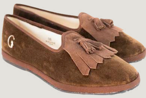
Dolomitica Tabacco Brown