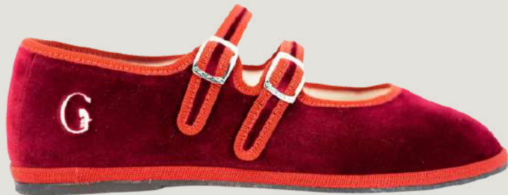
Gaia Double Lace Red Retail Price 249 $ Whole sale Price: 119$

Sizes EU: 20,21,22,23,24,25,26,27,28,29,30,31,32,33,34,35,36,37,38,39,40,41,42,43,44,45,46,47