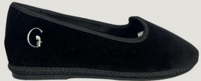
Black Coal Retail Price 199 $ Whole sale Price: 92$