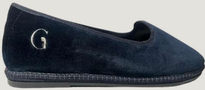
Dark Blue Retail Price 199 $ Whole sale Price: 92$

Our classic handmade in Italy model, with an extra comfortable ergonomic patented sole