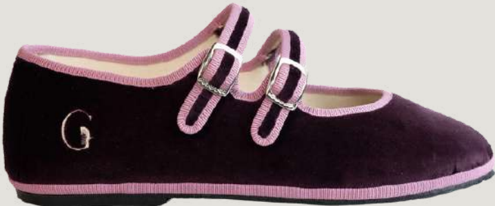
Calatrava Mary Jane Melanzana Retail Price 249 $ Whole sale Price: 119$