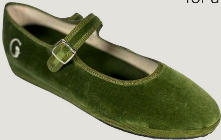
Forest Green Retail Price 229 $ Whole sale Price: 95$

Handcrafted in Italy, the Mary Jane by Gondolina, in 100% Cotton velvet from lake Como, blends classic charm with modern comfort. With a refined strap, subtle elevation, and Venetian-inspired design, it's perfect for any occasion.