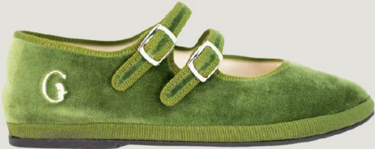
Sophia Retail Price 249 $ Whole sale Price: 119$

Double lace Maryjane handmade in Italy model, in 100% Cotton velvet from lake Como, with an extra comfortable sole