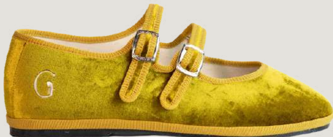
Nina Gold Silk Retail Price 249 $ Whole sale Price: 119$