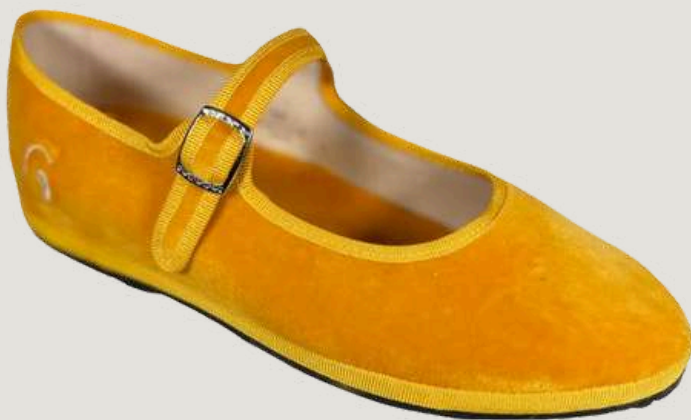
Royal Yellow Retail Price 229 $ Whole sale Price: 95$