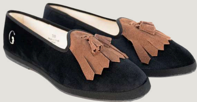
Dolomitica Black Coal

Unique dolomites inspire model, handmade in Italy model, in 100% Cotton velvet from lake Como, with an extra comfortable sole. The final design, which combines the moccasin and the classic Venetian shoe.