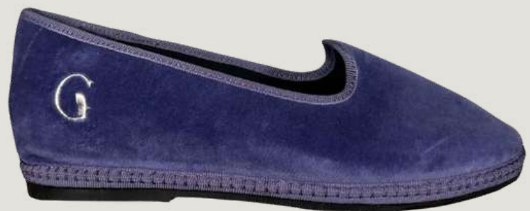
Lilie Purple Retail Price 199 $ Whole sale Price: 92$