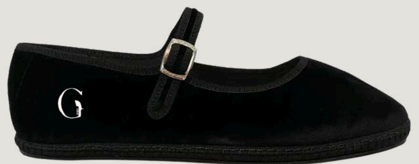
Black Coal Retail Price 189 $ Whole sale Price: 85$