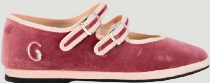
Lisa in velvet Retail Price 249 $ Whole sale Price: 119$