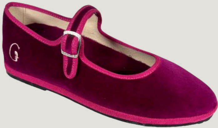
Pink Fuxia Retail Price 229 $ Whole sale Price: 95$