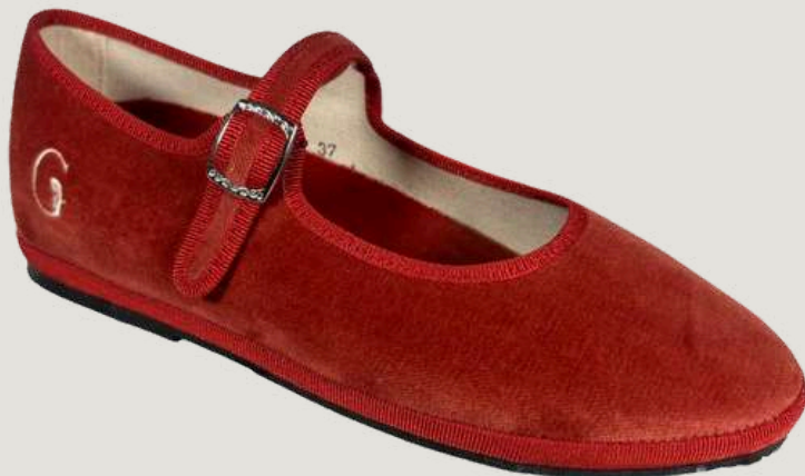
Trendy Brick Retail Price 229 $ Whole sale Price: 95$