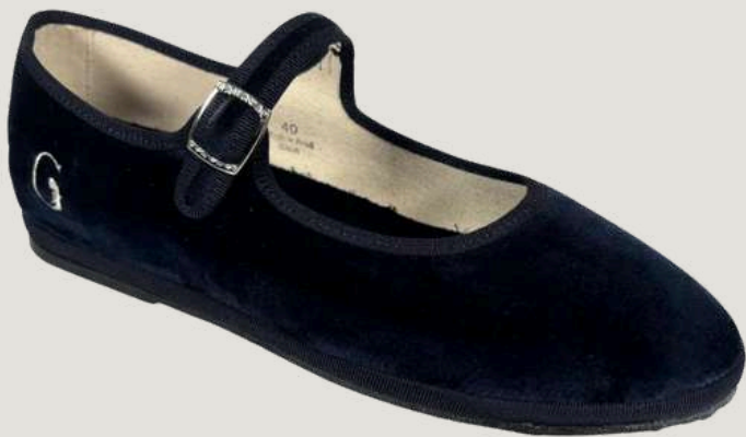
Dark Blue Retail Price 229 $ Whole sale Price: 95$