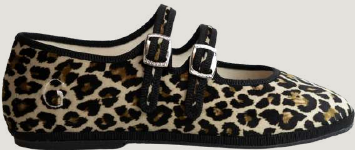
Sospiri Animal Print Retail Price 249 $ Whole sale Price: 119$