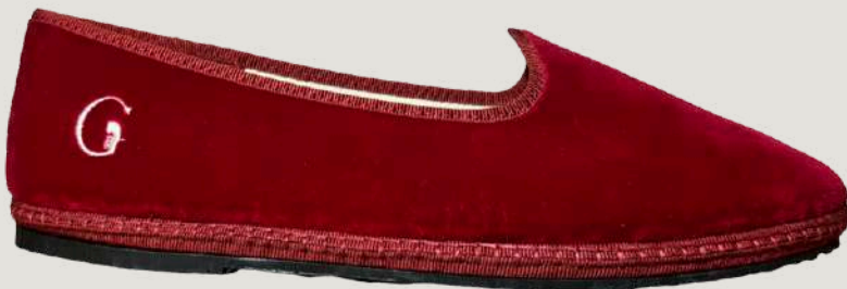
Venetian Red Retail Price 199 $ Whole sale Price: 92$