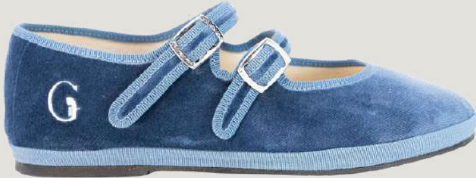
Rialto Light Blue Retail Price 249 $ Whole sale Price: 119$