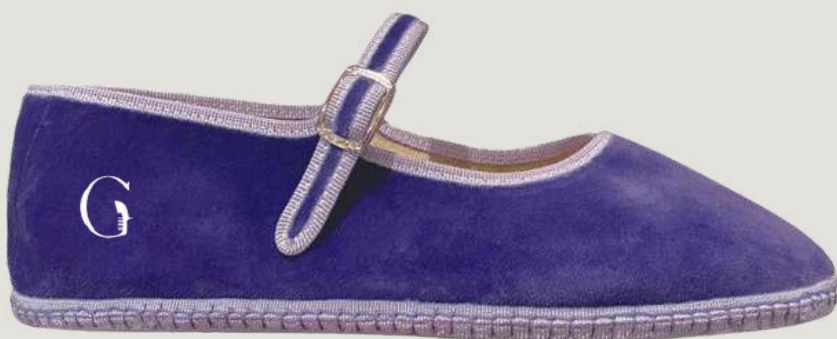
Soft Lile Retail Price 189 $ Whole sale Price: 85$