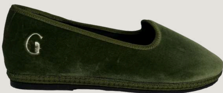
Forest Green Retail Price 199 $ Whole sale Price: 92$