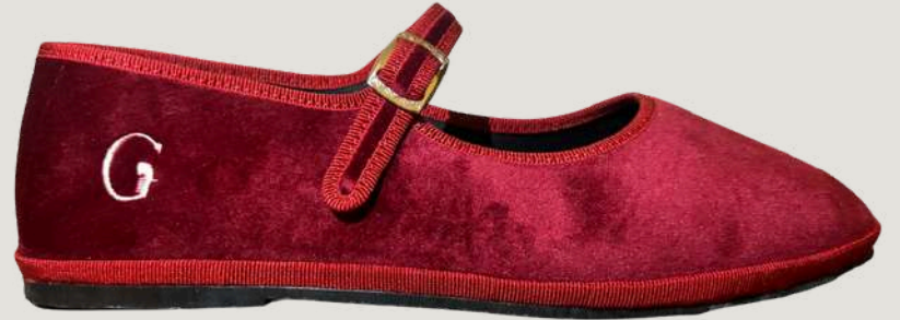
Venetian Red Retail Price 189 $ Whole sale Price: 85$