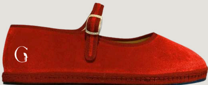
Venetian Red Retail Price 189 $ Whole sale Price: 85$