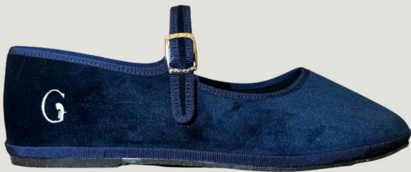
Ocean Blue Retail Price 189 $ Whole sale Price: 85$