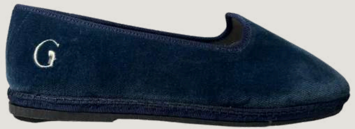
Ocean Blue Retail Price 199 $ Whole sale Price: 92$