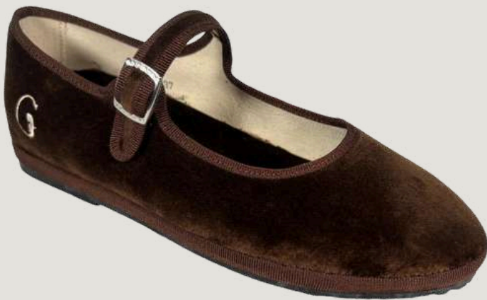
Tobacco Brown Retail Price 229 $ Whole sale Price: 95$