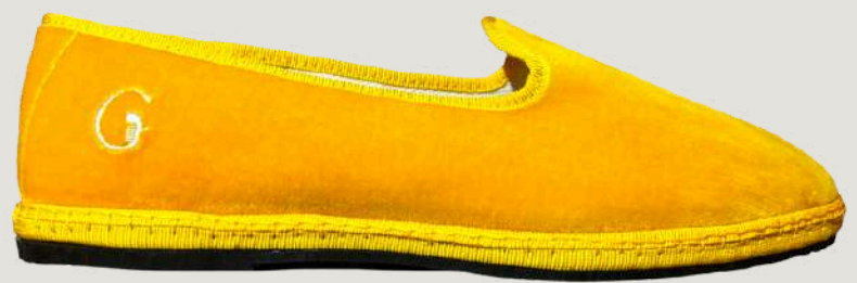
Royal Yellow Retail Price 199 $ Whole sale Price: 92$