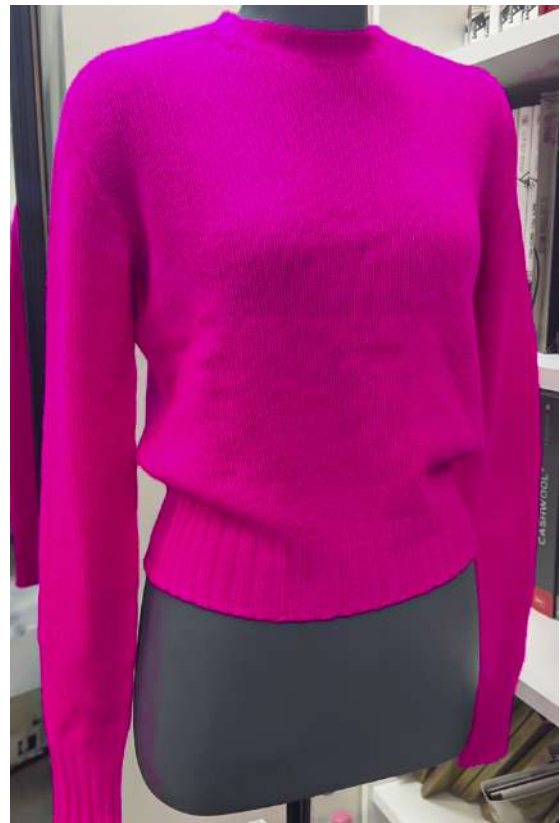
To the final garment