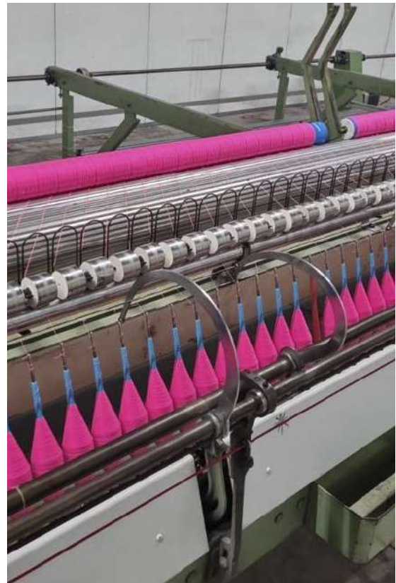
To the mill