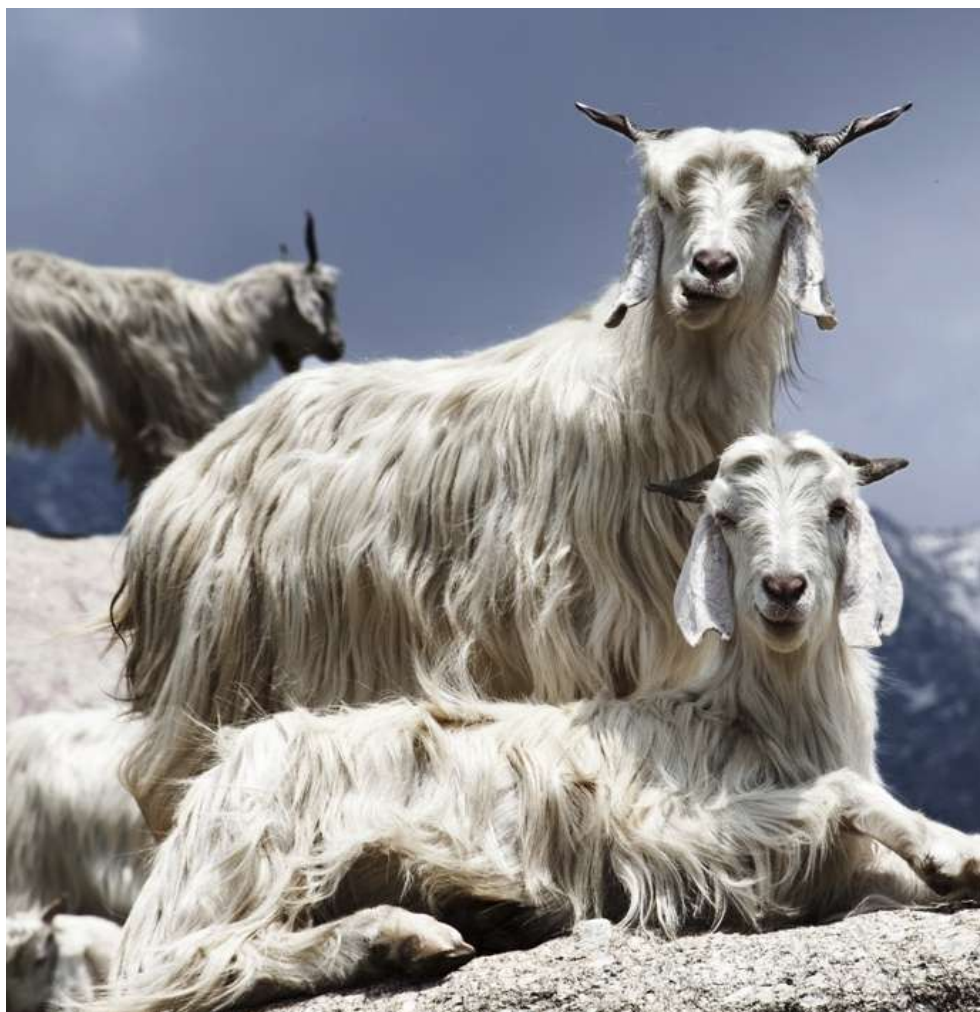
HIRCUS LANIGER COAT

EXCELLENCE AND QUALITY, EXPERIENCE AND MASTERY