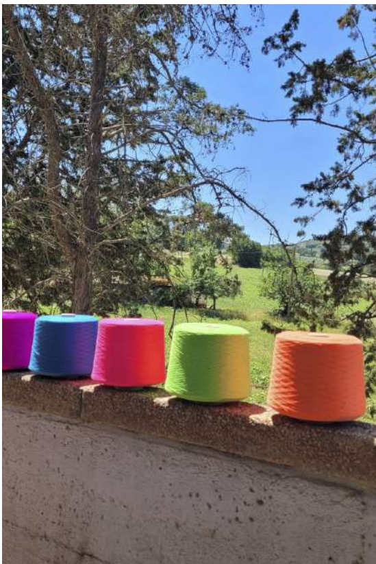
Up to the yarn