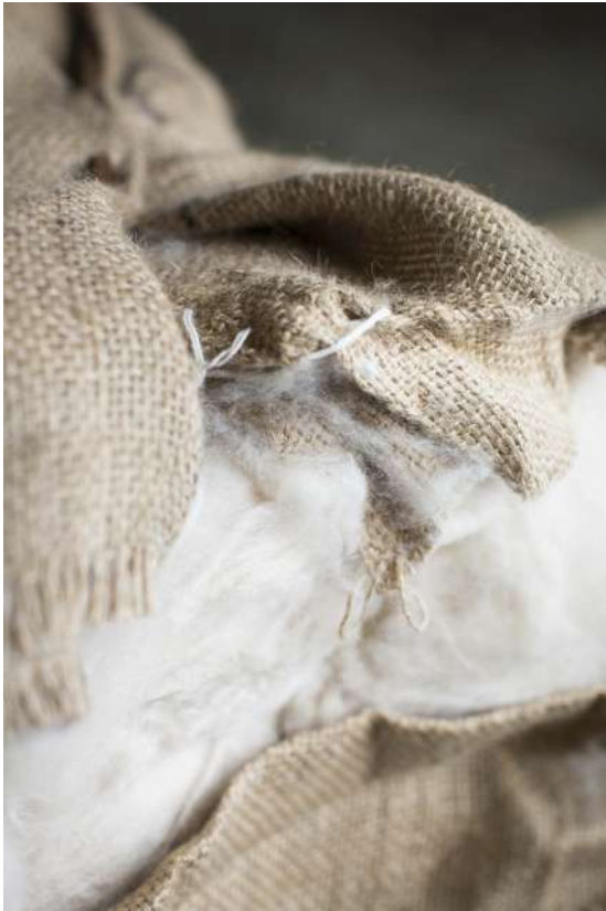
From the raw materials