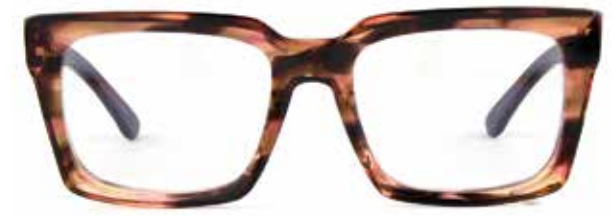
Mod. Bel Tenebroso