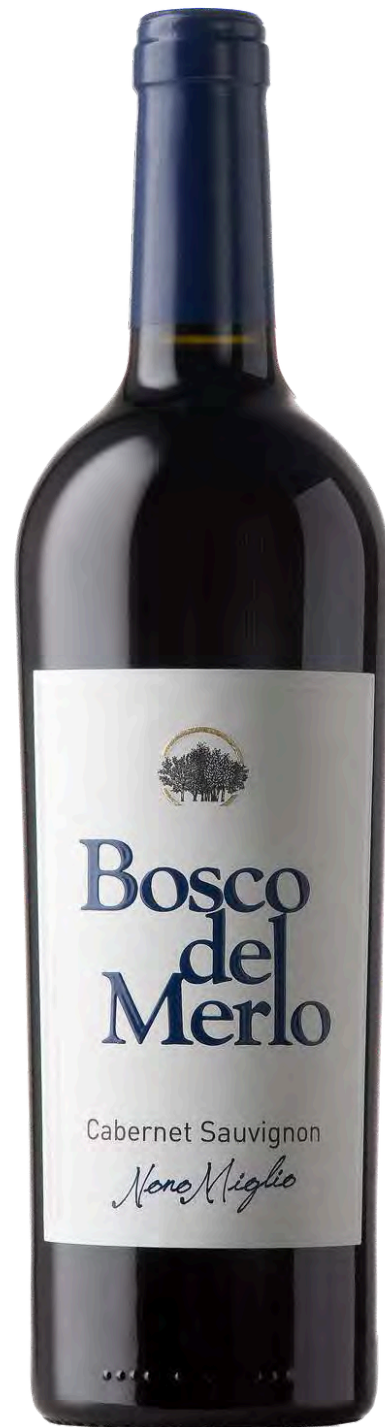
Cabernet Sauvignon Nono Miglio DOC Friuli