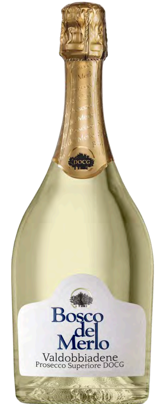
Valdobbiadene Prosecco Superiore DOCG