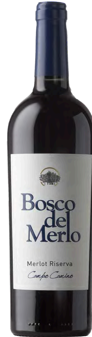
Merlot Riserva Campo Camino DOC Venezia