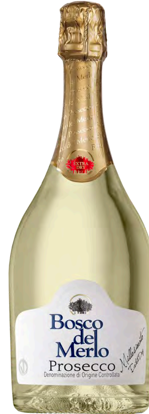
Prosecco DOC Millesimato Extra Dry