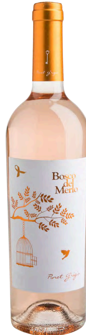
Pinot Grigio Rosè DOC delle Venezie