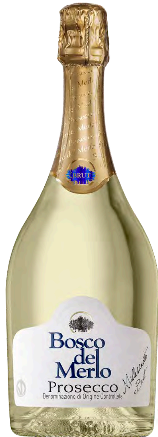
Prosecco DOC Millesimato Brut