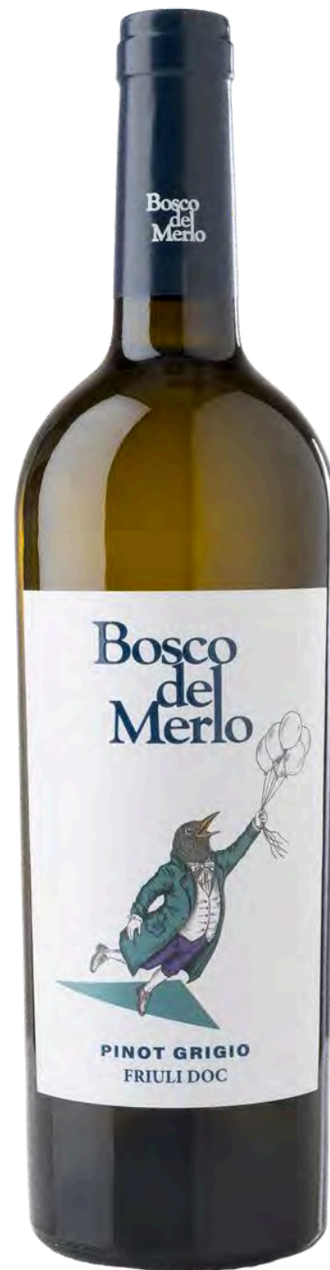
Pinot Grigio Tudajo DOC Friuli