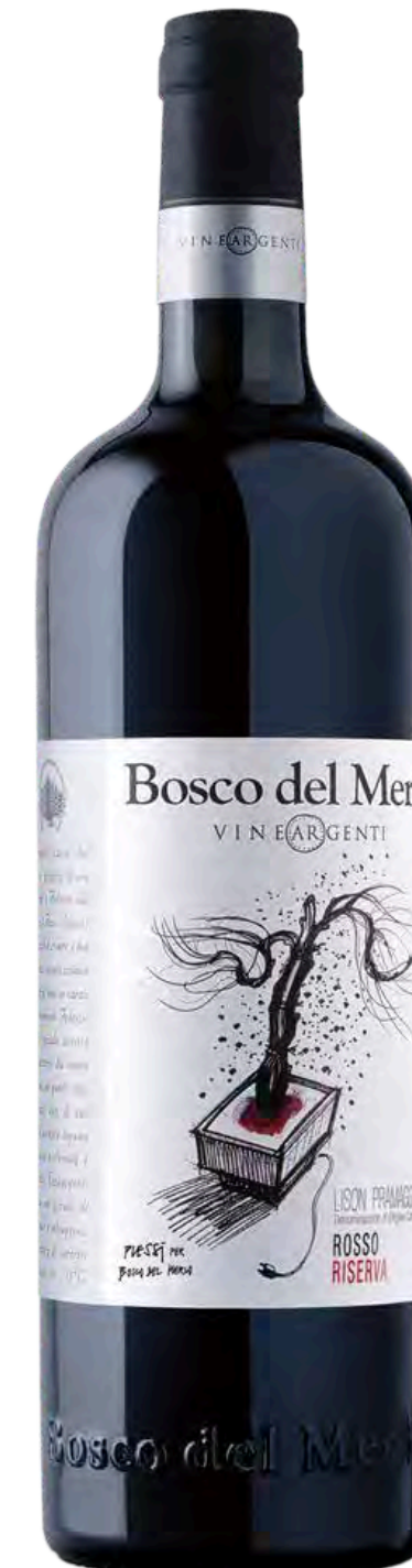
Vineargenti Rosso Riserva DOC Venezia