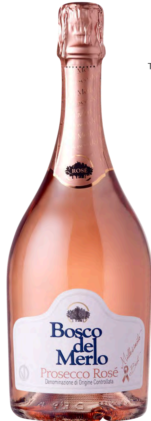
Prosecco DOC Rosé Millesimato Brut