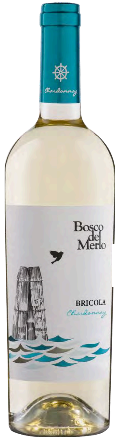
Chardonnay Bricola DOC Friuli