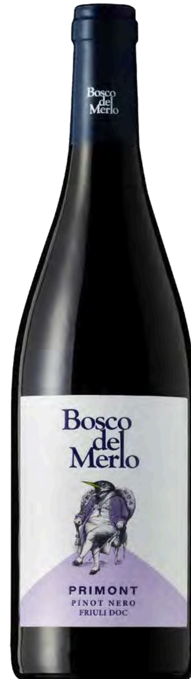
Primont Pinot Nero DOC Friuli