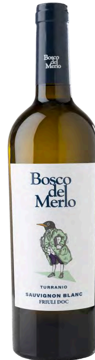
Turrano Sauvignon Blanc DOC Friuli