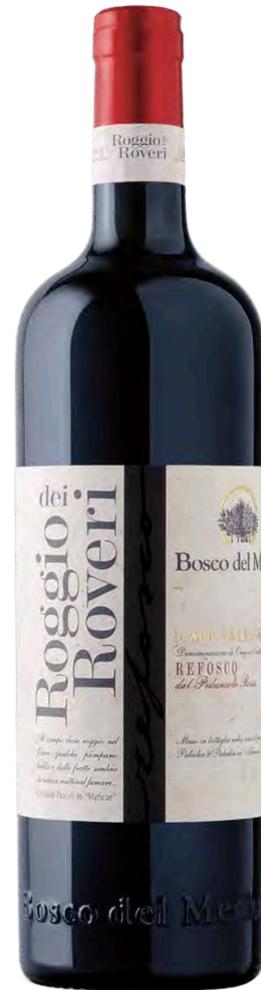
Refosco Riserva Roggio dei Roveri DOC Friuli