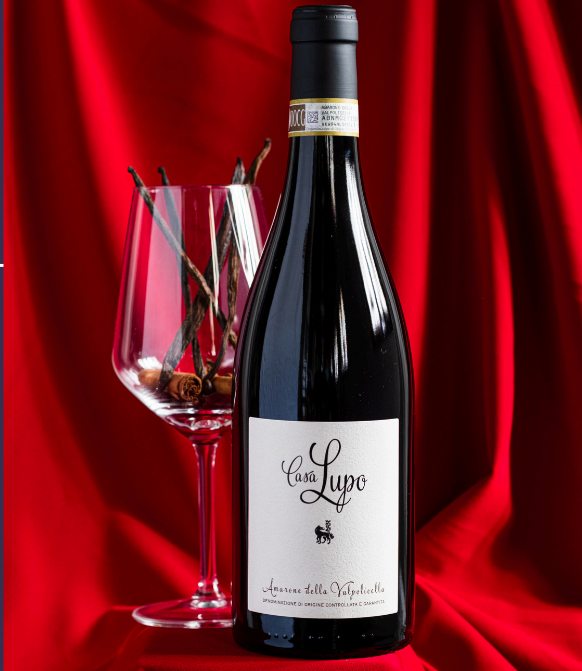
Amarone della Valpolicella DOCG