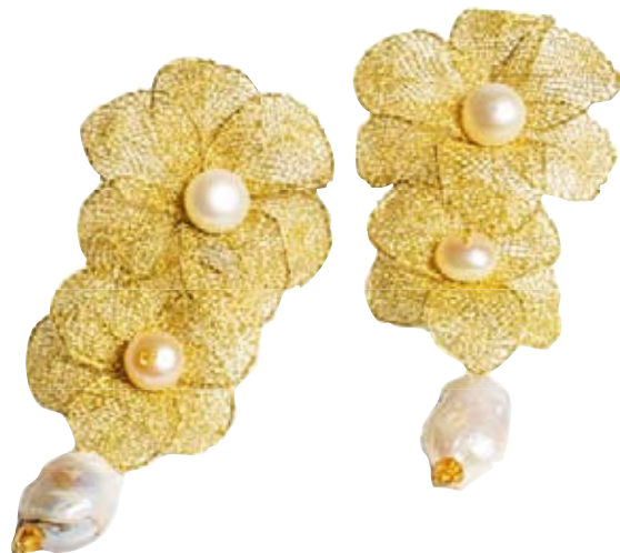
Camelia double-flower lace and pearl earrings by Maria Traini