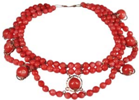
Collier in silver with red agates by Loredana Corbo