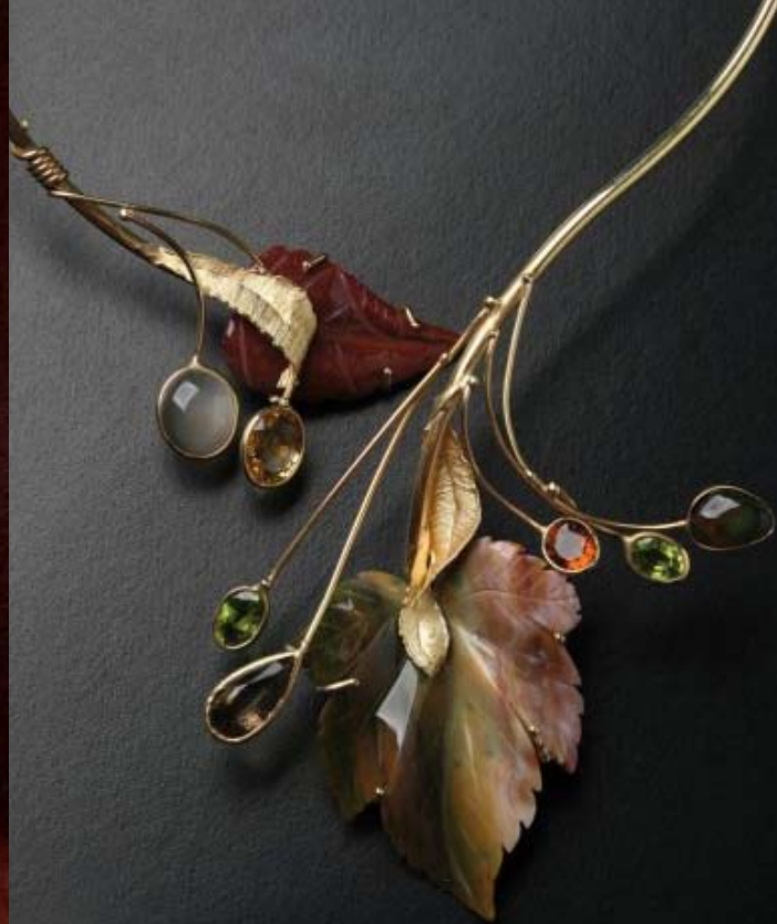
Collier Autumn in yellow gold and semi-precious stones by Silvano Zanchi