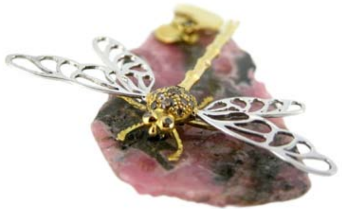
Charm Dragonfly #1 in yellow and white gold with rhodochrosite and brown diamonds by Sigismondo Capriotti