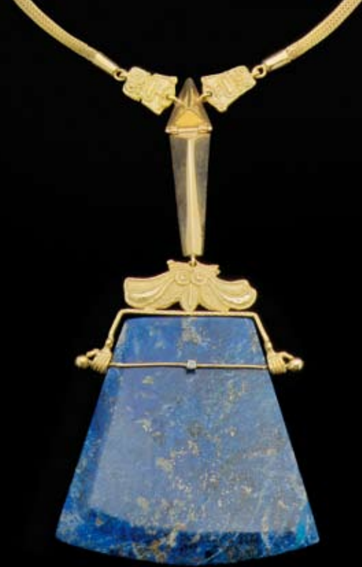
Collier in yellow gold with lapis lazuli and diamonds by Silvano Zanchi