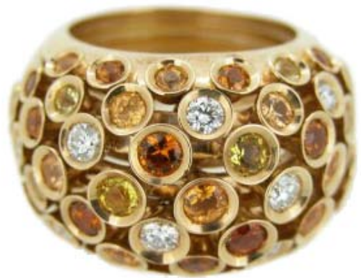
Ring Links in yellow gold with diamonds and sapphires by Sigismondo Capriotti