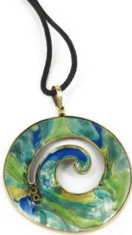
Necklace in nautical rope and charm in yellow gold with coloured enamels by Silvano zanchi

Water lilies and Japanese bridge by Claude Monet, 1897-1899