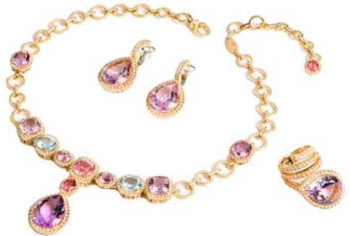
Parure Villa Medici in pink gold with tourmalines, aquamarines and amethyst quartzes by Sigismondo Capriotti