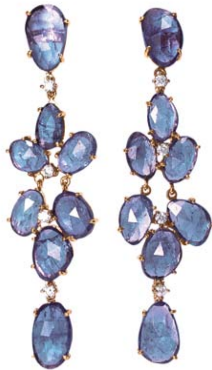
Yellow gold earrings with tanzanite and diamonds by Marco Meletti