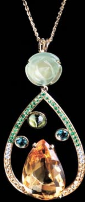
Necklace Demetra in yellow gold, pendant with diamond, yellow sapphire, tavorite, prehnite, green tourmaline, topaz citrine, peridot by Roberto Gatti