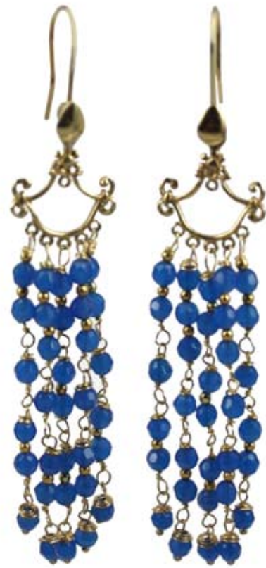
Earrings in silver and blue agates by Loredana Corbo