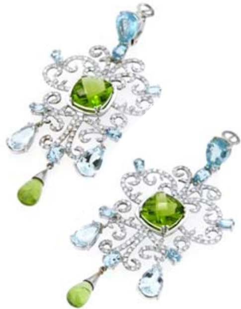
Arabesque earrings in white gold with diamonds, aquamarines and peridots by Sigismondo Capriotti

Le fonti del Clitunno by Carlo Wostry, 1920