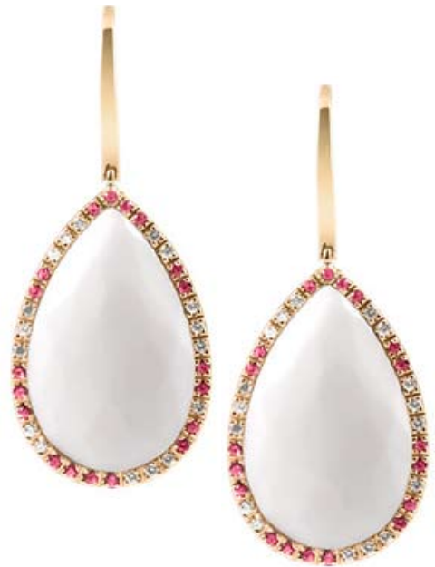
Yellow gold earrings with white agate and pink sapphires by Marco Meletti