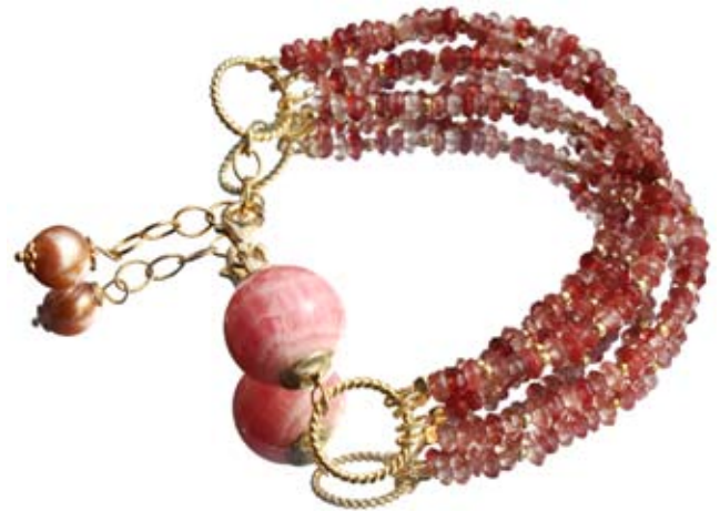
Bracelet in silver with agates, rhodochrosite and cultured pearl by Loredana Corbo