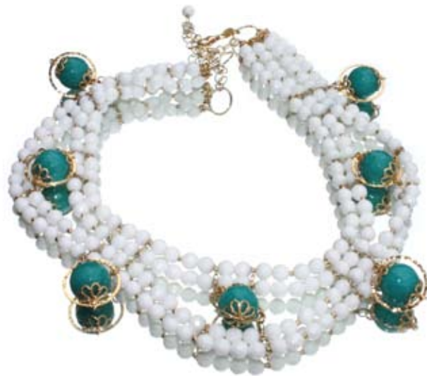
Collier in silver, white agates and turquoises by Loredana Corbo