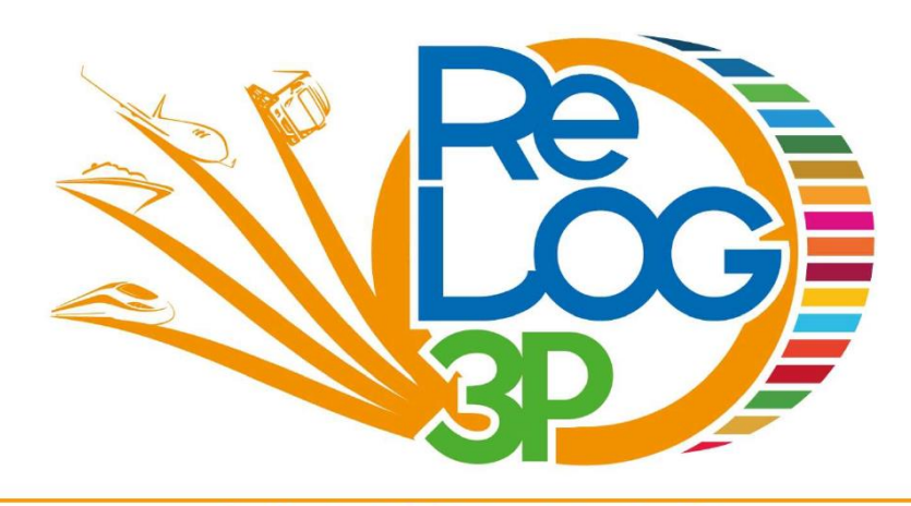
Reshaping LOGistics aiming for 3P People, Planet, Prosperity