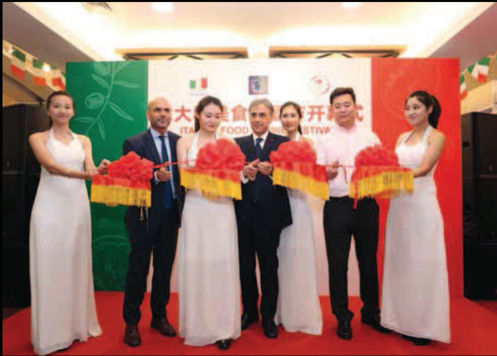
Promotion in BHG supermarket chain

cond and third tier Chinese cities as well. These results have been made possible as a result of all the (unprecedented!) attention and care we have dedicated to online communication on Chinese digital platforms, involving key opinion leaders. These are people with millions of followers on Chinese social media and can influence their decisions with their posts. This is the real big news compared to the past. We have changed the promotional strategy by not focusing exclusively on offline physical events (fairs, tastings, etc.), but have been paying special attention to digital communication and amplification of our events and messages in support of Italian wine. In a market with 1.4 billion people, in which half the population uses a mobile phone and of these a high percentage makes purchases via Smartphone. The use of online/digital communication and promotion has also made a difference as it has a very convenient cost/benefit ratio. And this is being borne out by the results. The export value of Italian wines to the “Terra di Mezzo”, which, two years ago, did not reach $90 million USD, will be around US $ 140 million this year, an increase of 22% over the previous year. And our market share is also growing (rising from 4.4% to 6%).