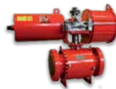
Trunnion Side Entry