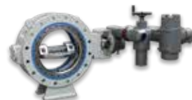
DOUBLE & TRIPLE Offset Butterfly Valves