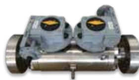
Double Block and Bleed