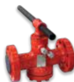
Lubricated Plug Valves