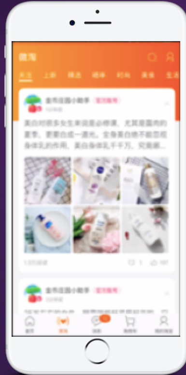
Share & Recommend